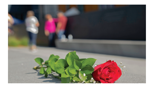
5,000 Organ Donors

In May, LifeSource honored the wishes of our 5,000<sup>th</sup> organ donor since official reporting began in 1990.