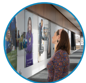
Walk the Hall of Heroes and learn about the impact donation has.