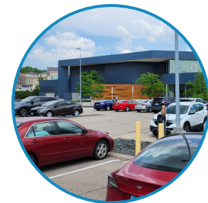
Thank you for using the main parking lot and observing the reserved spaces.