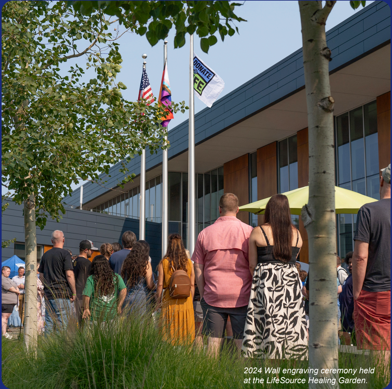
2024 Wall engraving ceremony held at the LifeSource Healing Garden.